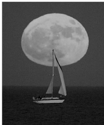
This picture of Gale Force appeared on the front page of the Milwaukee Journal Sentinel June 22 issue.

Even more members wanted to go, but the boats filled up too fast. Not to worry. There are two more Full Moon Sails scheduled for this summer. The next Full Moon Sail is Thursday, July 21, a sign-up sheet has already been started for it, and Friday, August 19. Priority will be given to those who didn't make the cut-off for the June 21 evening sail. Stop in at the Sailing Center office to sign up or call 414-277-9094.