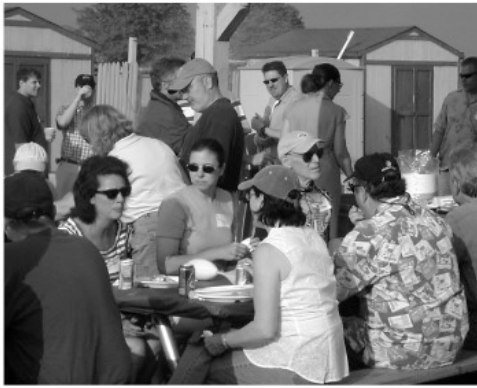
There was no shortage of food or conversation as members unwound after the workday.

The first Friday Night Barbecue on June 17 was a huge success. One hundred fifteen members attended the event and enjoyed the great food, great company and, as it turned out, the great weather. The attendance was beyond what the Membership Committee expected. The count of 115 members does not include the 17 vol-