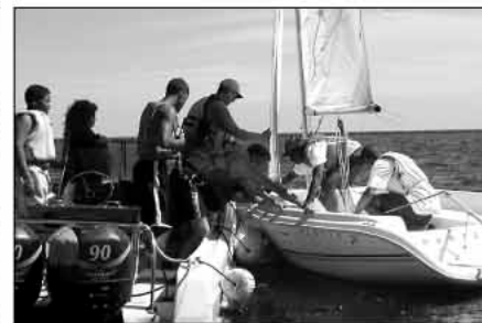
... and they scramble off the dinghy.