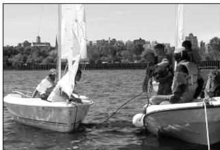
The first crew approaches their team boat ...

The final week of summer youth instruction is Sail-A-Bration , a celebration of sailing and an opportunity for kids to do other things. This year there were trips on keelboats, 18' and 36' catamarans and fun races. A relay race was held on the last day of Sail-A-Bration week.