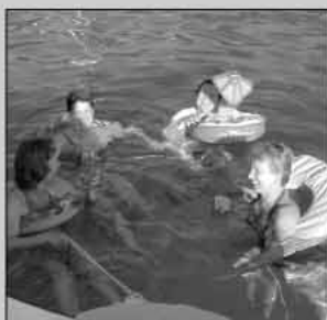
... or enjoy other water sports