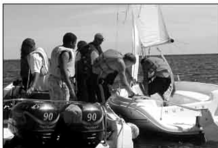
The second crew climbs on the dinghy ...