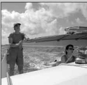
Sail the boat ...