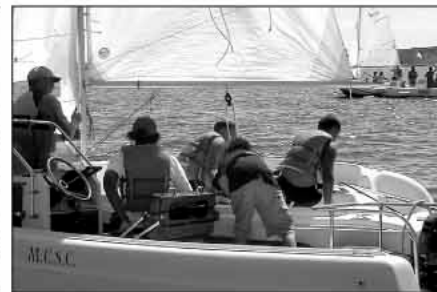
... and off they go for the windward mark. The competition appears in the background.